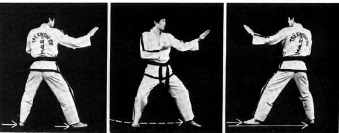
Away from the opponent