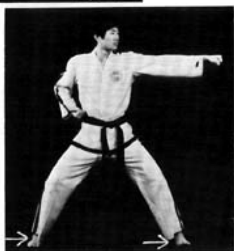
Closing in to the opponent