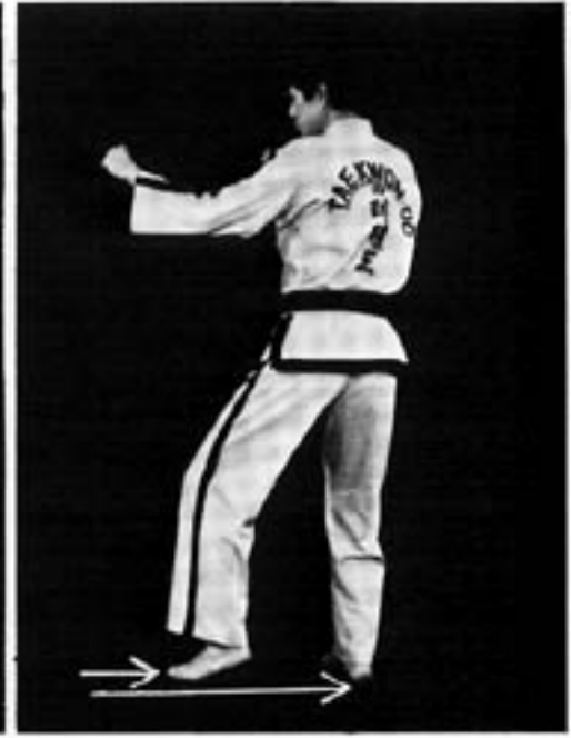
Changed into a Rear Foot Stance