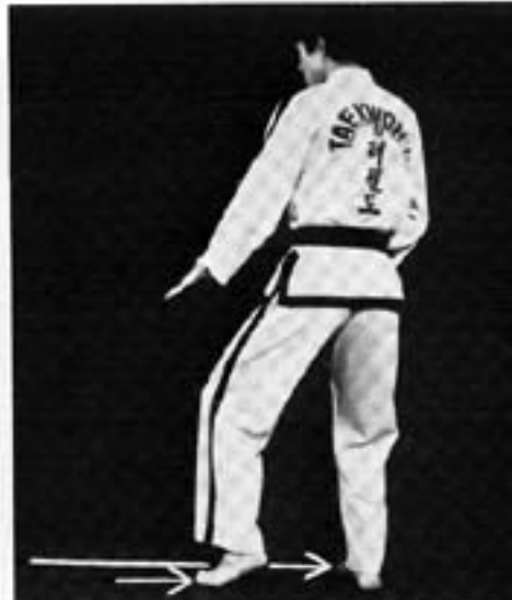
Double Step-Shift Sliding