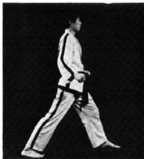
Closing in to the opponent