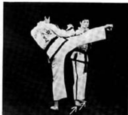
Shifting to the Side