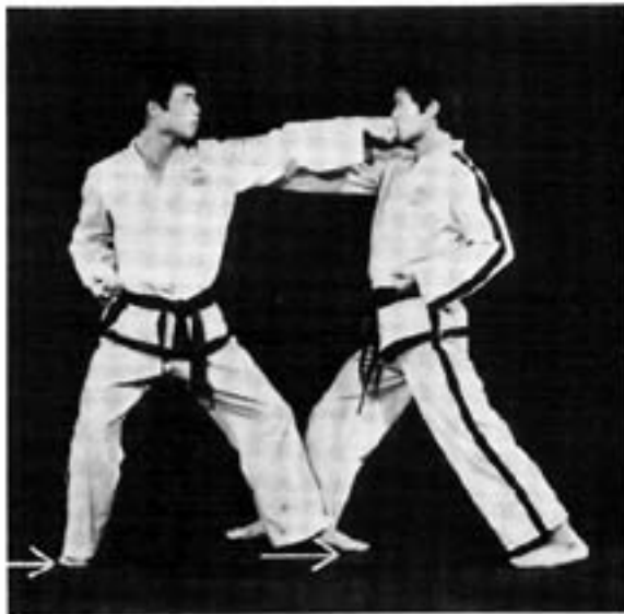
Closing in to the opponent