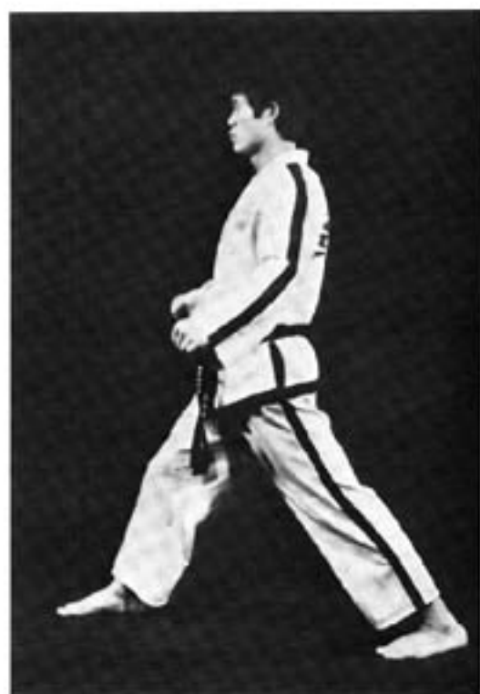
Right Walking Stance