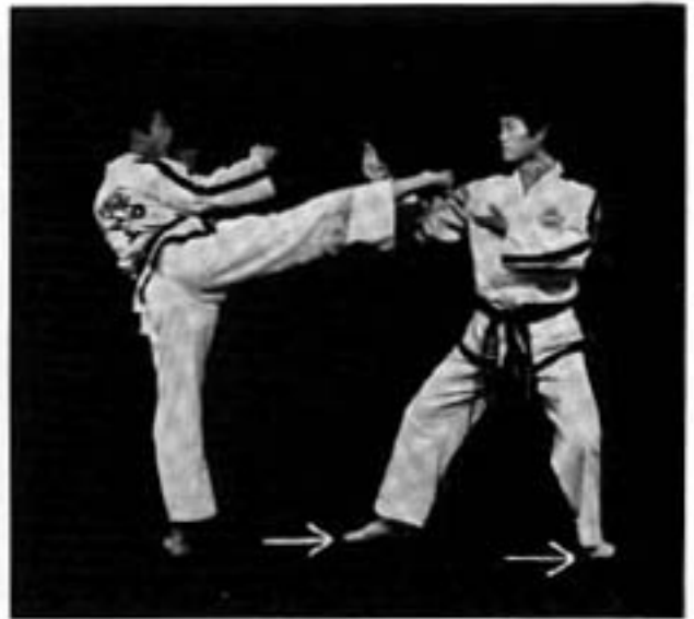
Away from the opponent