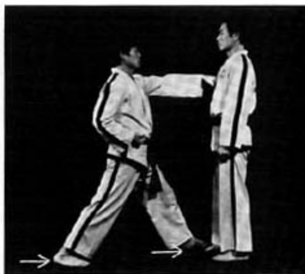
Closing in to the opponent