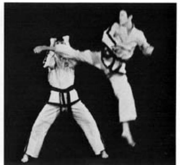
Away from the opponent

Note: The same method applies to a fixed stance.