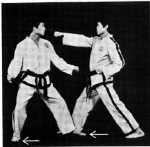
Away from the opponent