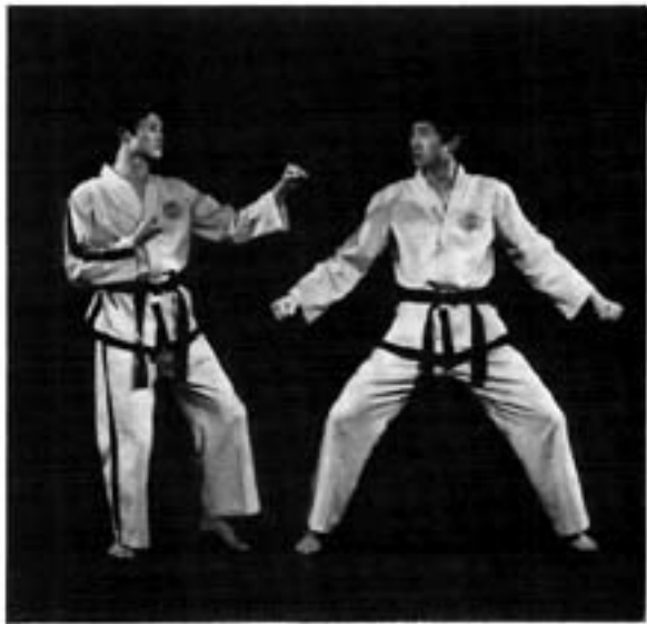
Away from the opponent