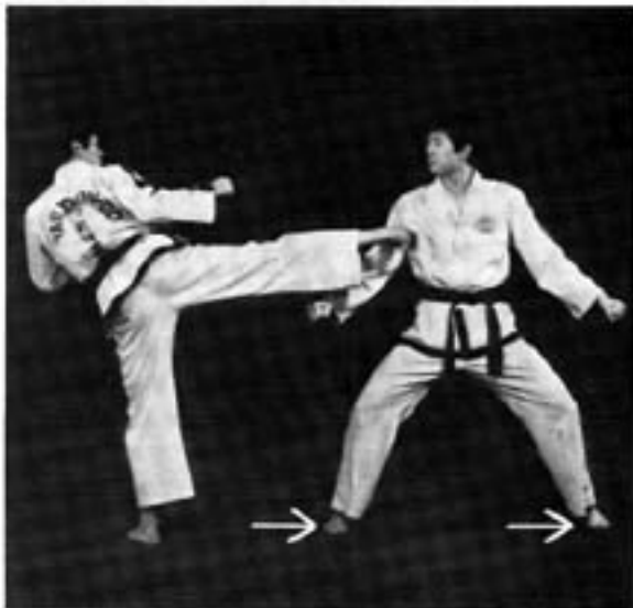
Away from the opponent