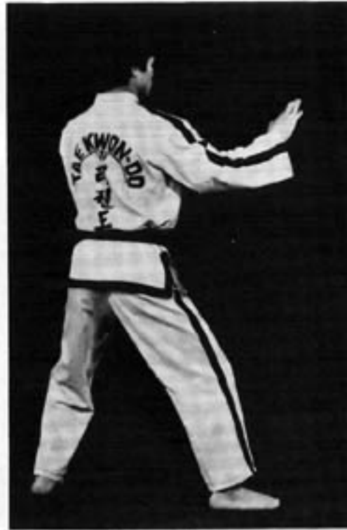
Body weight is rested on the right leg