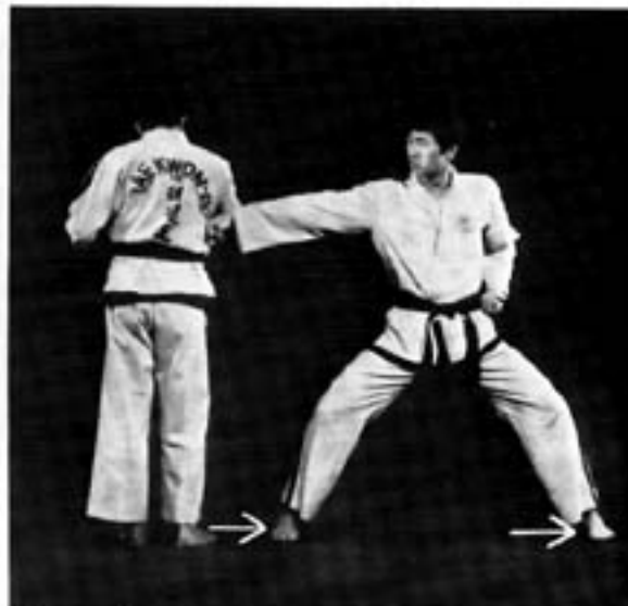
Closing in to the opponent