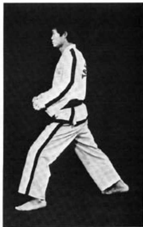
Body weight is rested on the left leg