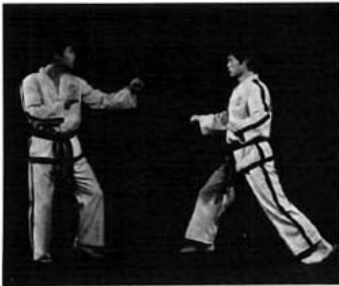
Closing in to the opponent