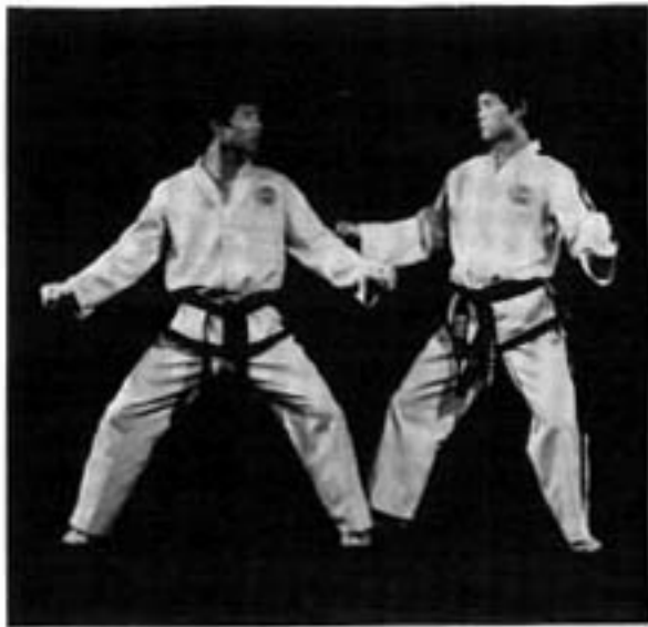
Away from the opponent