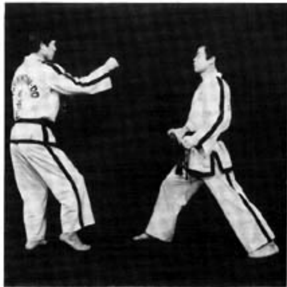
Away from the opponent