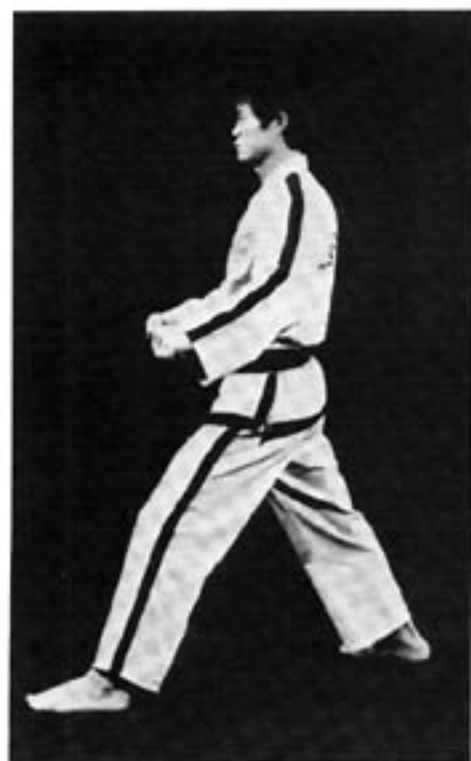
Left Walking Stance