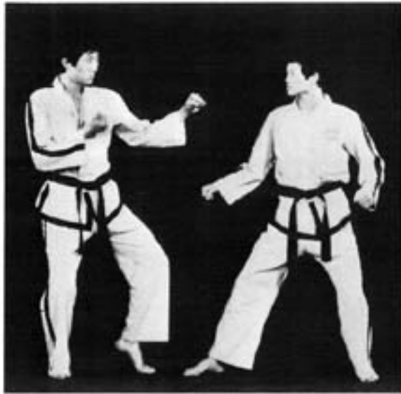
Away from the opponent