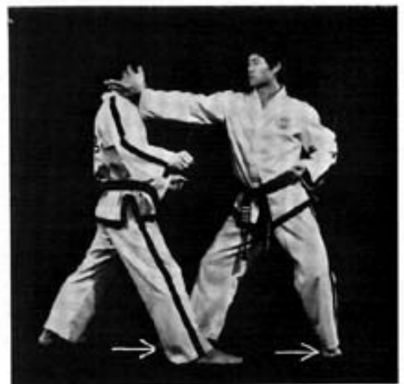
Away from the opponent