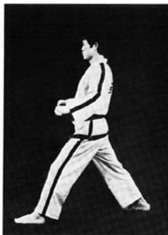
Left Walking Stance