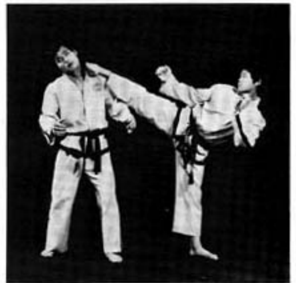
Away from the opponent